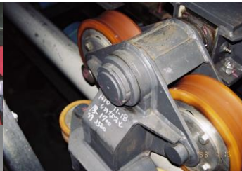
Roller Coaster Guide Roller