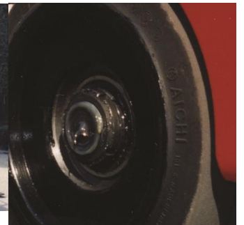
Wheel Axis Stopper