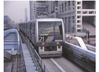
New Transport System