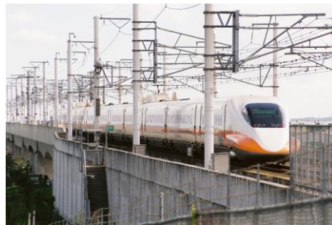
Taiwan Shinkansen 700T(Bullet Taiwan)