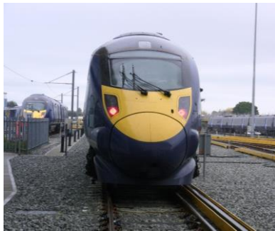
UK Express 395 Series