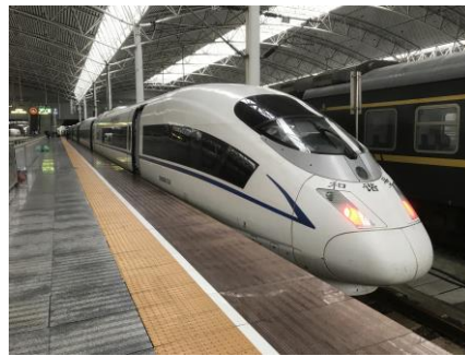
China High-speed rail CRH3 Series