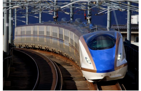
Shinkansen E7 · W7 (Bullet Train)