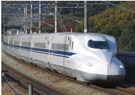
Shinkansen N700 (Bullet Train)